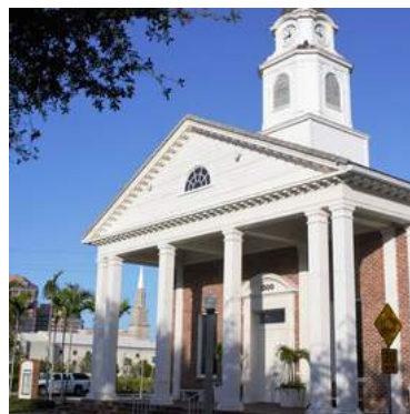
Memorial Presbyterian 🏠🏠