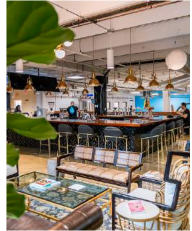
Pumphouse Coffee Roasters