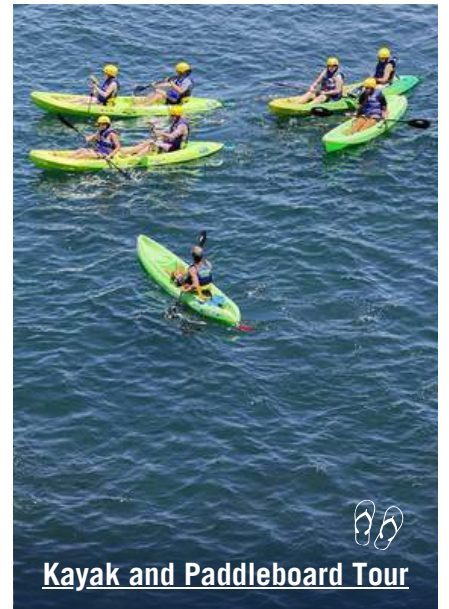
Kayak and Paddleboard Tour