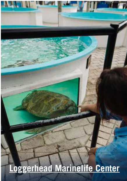
Loggerhead Marinelife Center