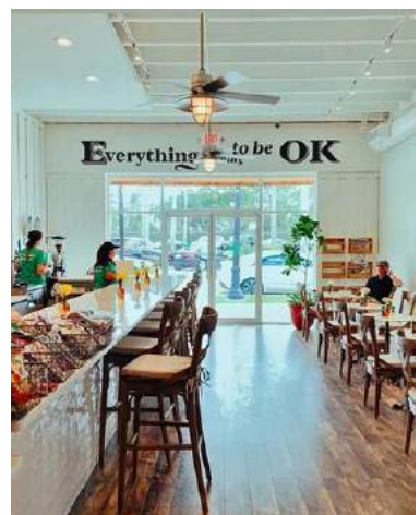
Field of Greens ☞☞