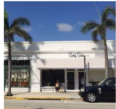
Surfside Diner ☞☞