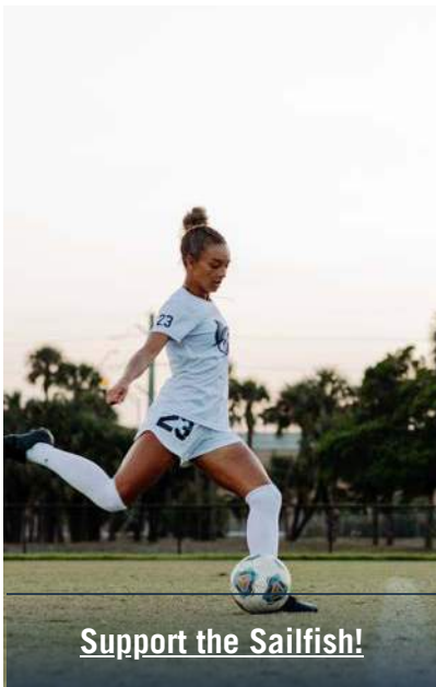
Support the Sailfish!