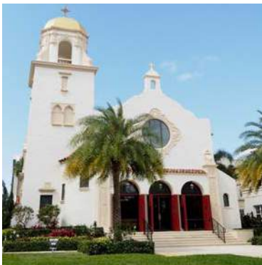
Holy Trinity Episcopal 🏠🏠