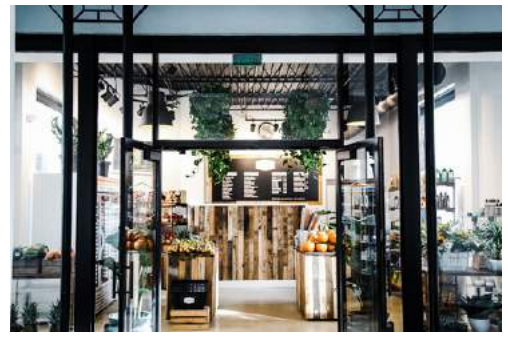
Celis Juice Bar