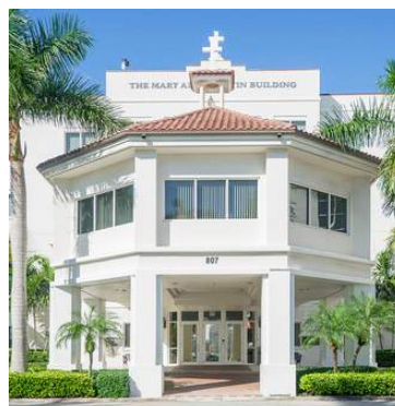
Truth Point Church