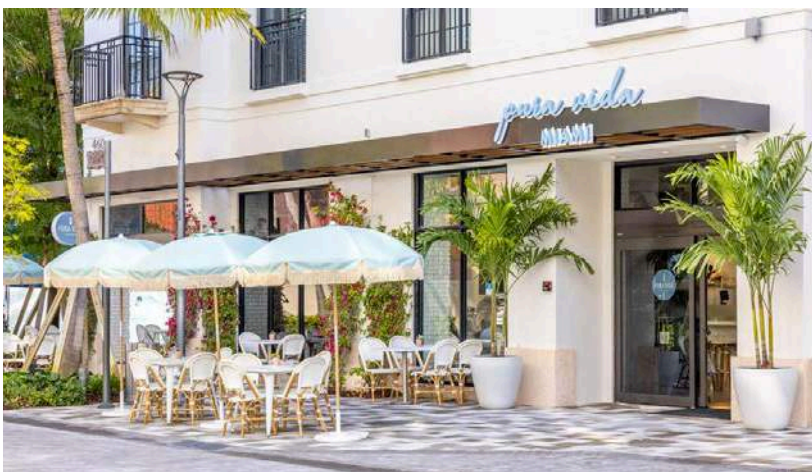
Pura Vida ☞☞