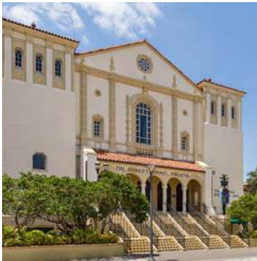
Christ Fellowship 🏠🏠

We recommend visiting one of the twenty churches within minutes of PBA's campus, where many PBA students find their church home! All of the local churches represent diverse denominations, all of which provide a great opportunity to immerse yourself in the role that faith plays in our community.