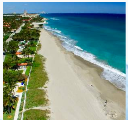
John D. MacArthur Beach State Park