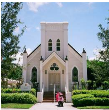
St. Anne's Catholic Church