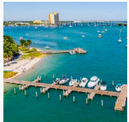
Lake Worth Beach