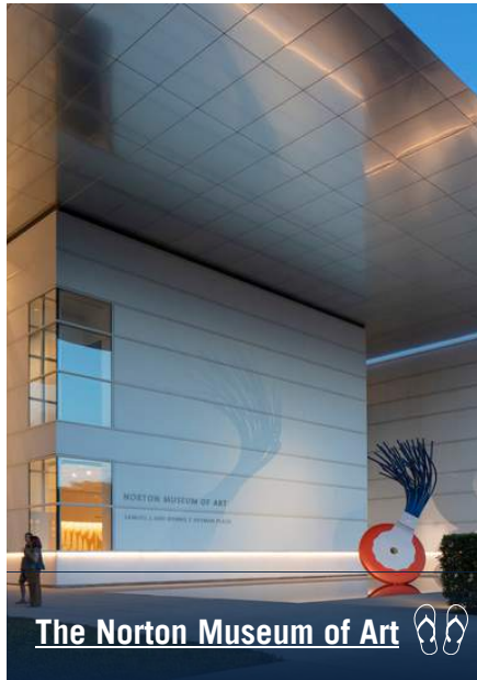
The Norton Museum of Art

From exploring local marine life and touring historical art museums to riding a bike along the lake trail by the Intracoastal Waterway and listening to live music outdoors year-round, there are countless ways to enjoy the unique activities West Palm Beach has to offer!