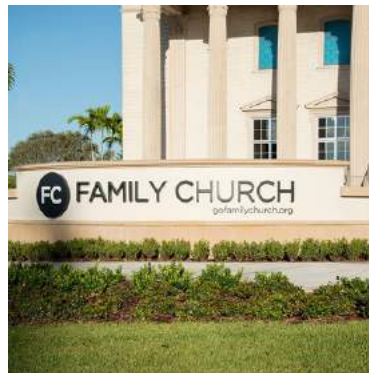
Family Church Downtown 🏠🏠